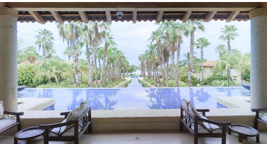
Lobby of the St. Regis Resort Punta Mita, Mexico