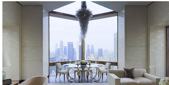
Four Seasons Ty Warner Penthouse New York City, NY